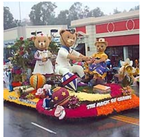
Rotary's float entry had to bear some bad weather during the 2006 Rose Parade.

"The float is a separate entity," he notes,