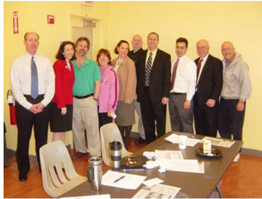
Some of our Breakfast Meeting regulars in their new meeting location at the Morris Center YMCA.