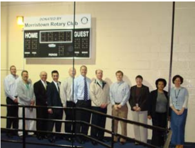
Some of our Breakfast regulars posing with the new YMCA scoreboard recently donated by our Club!