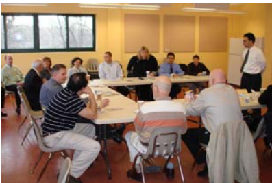
Last week's Breakfast meeting had 18 Rotarians in attendance! We're not sure, but think it's a new record... we hope it's the old record soon!