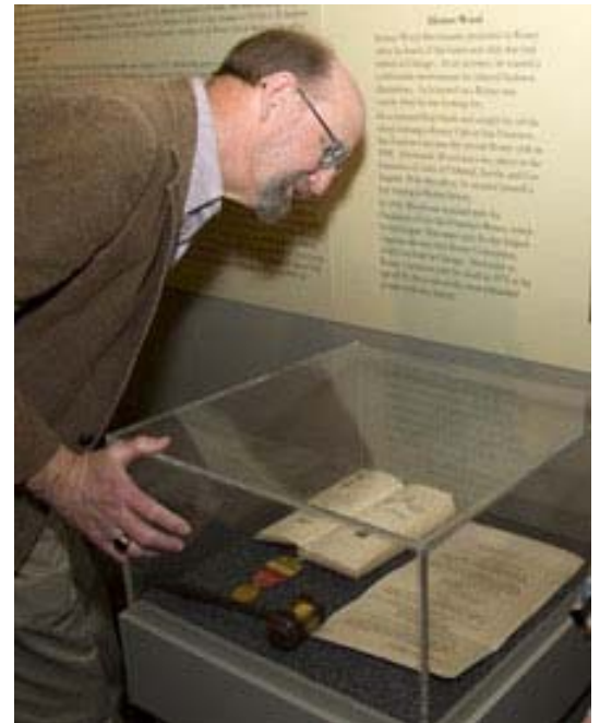
Rotarians in District 5150 (California) put Rotary artifacts on display as a recruiting and public relations tool.

The bulk of the exhibit, which opened in May, featured Rotary-related artifacts, including a child's iron lung, a convention badge from 1915, and dozens of pins from