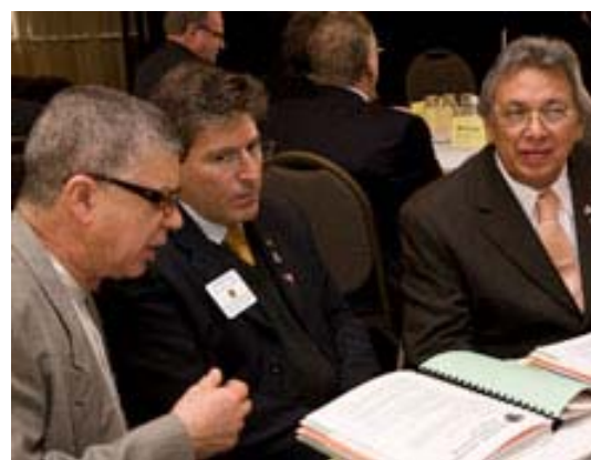
Regional Rotary International Membership coordinators attend a training seminar on how to help clubs and districts achieve membership growth.

"Most alumni aren't asked to join Rotary, and that represents a tremendous invest-