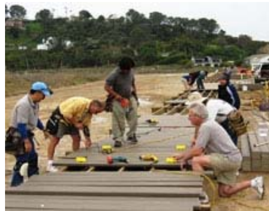
Members from the Rotary Club of Del Mar, California, USA, give a helping hand on the construction of a new boardwalk that will run through the San Dieguito River Park.

The park's director asked the club if it would install wood planks on an existing base to create a boardwalk over the wetlands, which will give visitors the sensation