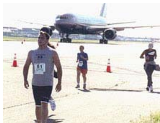
The airplane on the tarmac signals the midpoint for runners during the Thomas Carmody Memorial 5K Runway Run.

"One of our biggest supporters this year was JFK IAT [International Air Terminal],